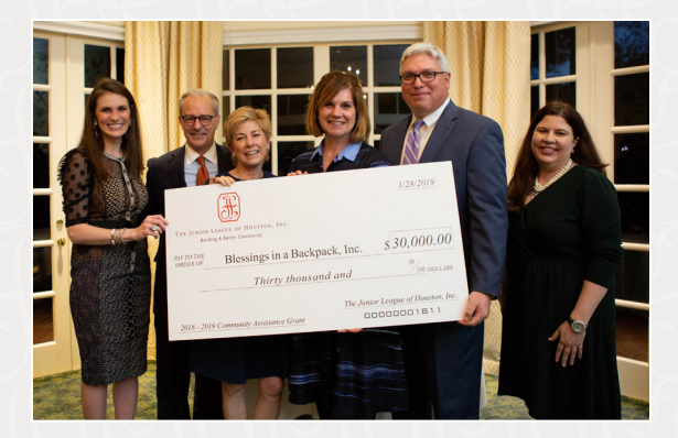
$30,000 – Blessings in a Backpack

The Woods Project provides underserved high school students from Houston with transformative, experiential outdoor learning opportunities that allow them to develop life and leadership skills and behaviors needed for success. League funds will allow 47 volunteers to receive wilderness and first aid training to support the overall health, safety and well-being of students and acquire gear including tents, sleeping bags and hiking books to be used by the students participating in the program.