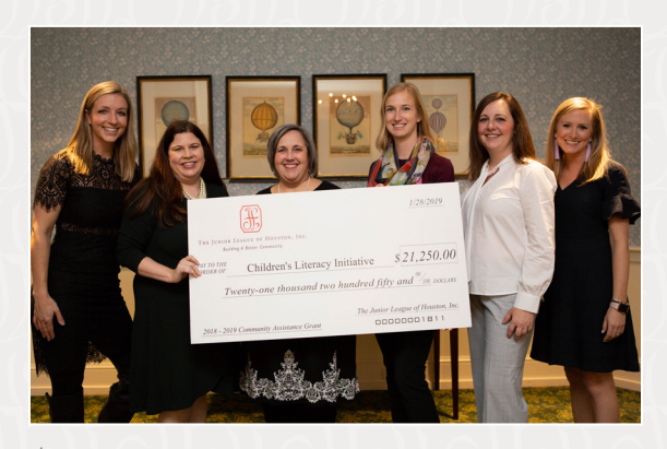
$21,250 — Children's Literacy Initiative