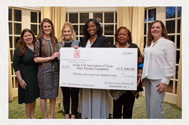
$13,100 - Sickle Cell Association of Texas